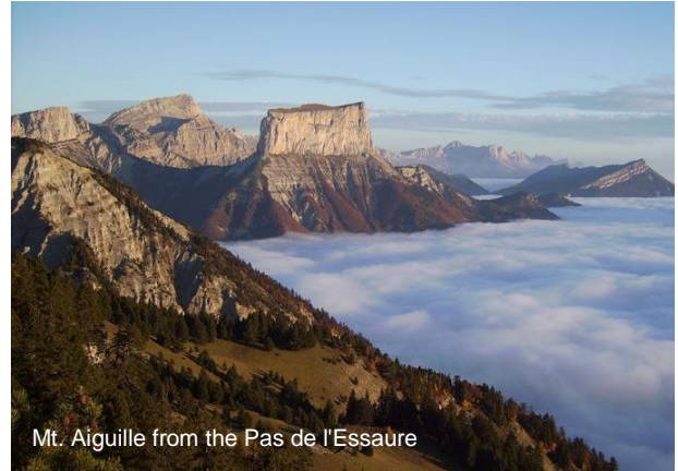
Mt. Aiguille from the Pas de l'Essaure