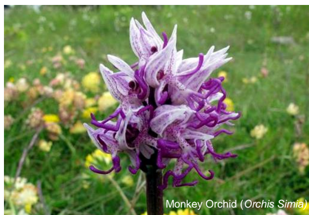
Monkey Orchid ( Orchis Simia )

In order to book your place on this holiday, please give us a call on 01962 733051 with a credit or debit card, book online at www.naturetrek.co.uk , or alternatively complete and post the booking form at the back of our main Naturetrek brochure, together with a deposit of 20% of the holiday cost plus any room supplements if required. If you do not have a copy of the brochure, please call us on 01962 733051 or request one via our website. Please stipulate any special requirements, at the time of booking.