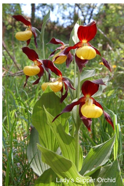
Lady's Slipper Orchid

We will make our way to a point north of the village of Les Nonnieres, passing clumps of Blue Aphallanthes ( Aphallanthes monspeliensis ), to explore some pine woods and meadows. These woods are particularly rich, containing a good number of Lady's Slipper Orchids ( Cypripedium calceolus ), Bird's-nest Orchid ( Neotia nidus-avis ), Fly Orchid ( Ophrys insectifera ), Phyteuma nigra (Black Rampion) and the Fly Honeysuckle ( Lonicera xylosteum ). From here we will return a little way south and enter the Vallee de Combau. Here we may see Chamoix as well as the local specialty Orchid ( Orchis spitzelii ) and Gentiana angustifolia (Trumpet Gentian). Lunch will be taken at the top of the valley, next to a stream and a ford. After lunch we will visit the delightful village of Archiane and its towering limestone cliffs.