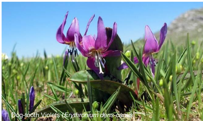
Dog-tooth Violets ( Erythronium dens-canis )

Continuing on, we will leave the motorway at Grenoble, and make our way up onto the Vercors plateau, and on down through Lans en Vercors to the quiet town of La Chapelle en Vercors. Here we complete our journey at the family run Hotel Bellier, our base for the week. There may have time for some gentle exploration in the flower-filled meadows in the vicinity of the village, where we might see Man Orchid ( Orchis anthropophora ) and Sword-leaved Helleborine ( Cephalanthera longifolia ).