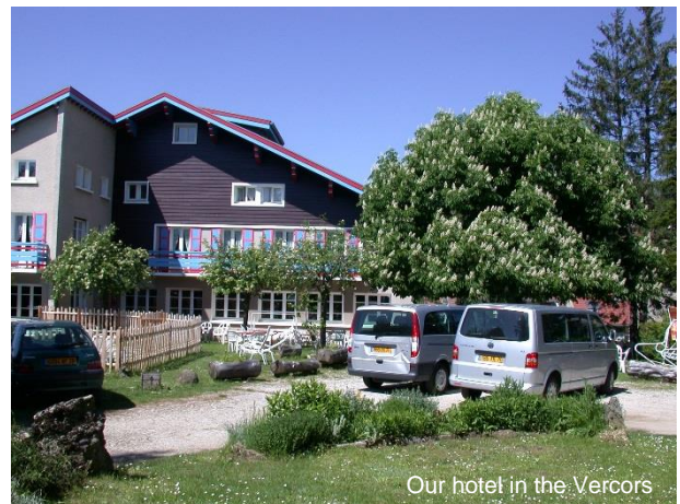
Our hotel in the Vercors